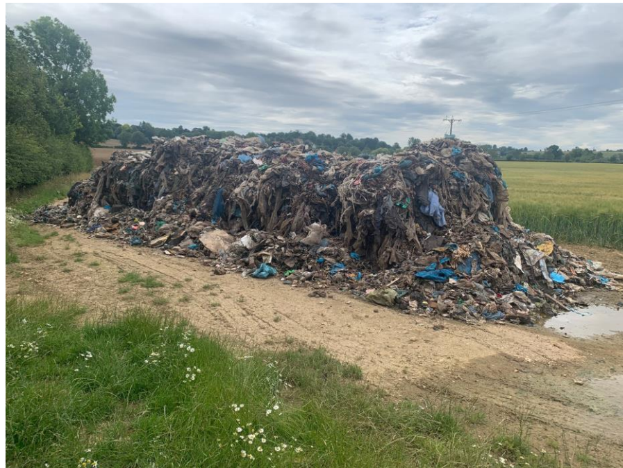
Waste Deposit- Leadenham (Farmland 40 Tonne Deposit)